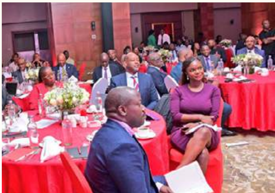
Participants follow proceedings during the Absa Africa Financial Markets Index and Economic Outlook Forum in Kampala