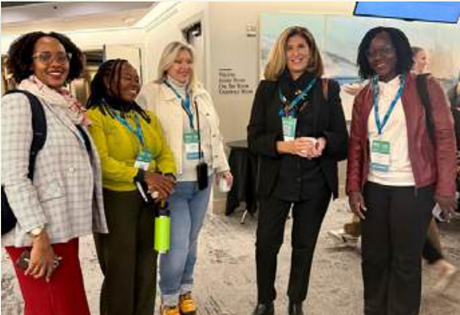
Uganda's delegation, in partnership with the Uganda High Commission in Canada, poses for a photo at the summit

trust. As digital platforms increasingly influence travel decisions, discussions explored how destinations can responsibly leverage AI to enhance visibility, provide accurate information, and strengthen confidence among international travelers. Uganda's participation in these conversations reinforces the importance of shaping a strong, credible digital tourism presence while safeguarding cultural integrity.