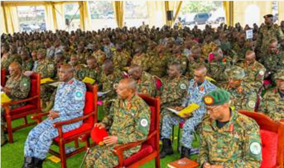
Officers during the meeting

On the other hand, President Museveni tasked the newly elected UPDF representatives to closely monitor government programmes including the Parish Development Model, free education, road construction and immunisation, while noting that although preventive healthcare has improved, challenges remain in curative services.