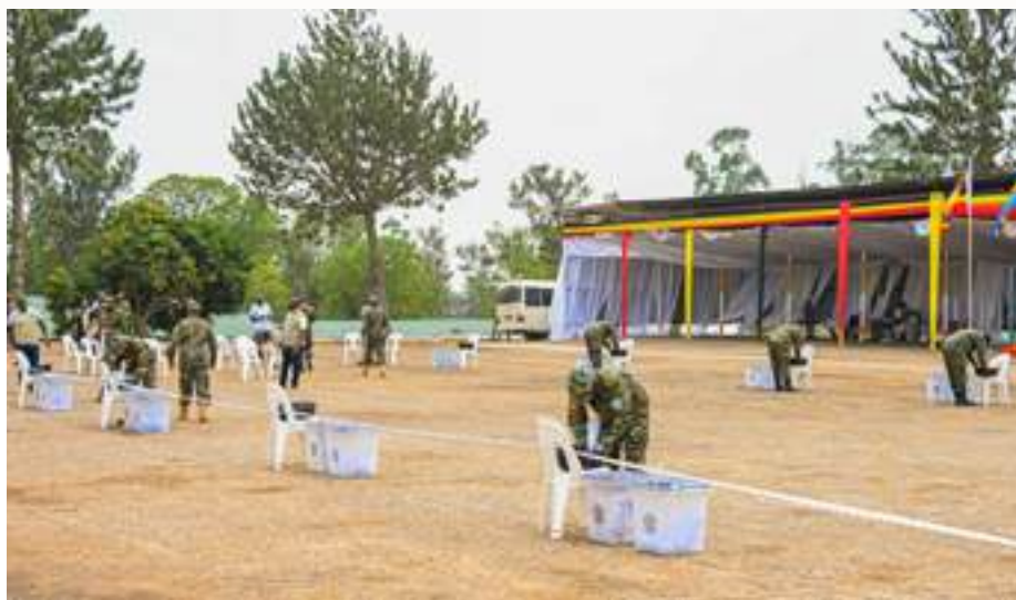
Officers exercising their voting right to elect their representative

He cited the decision by Members of Parliament to increase their salaries as an example of an issue that could have been addressed earlier if such mechanisms were effectively utilized.