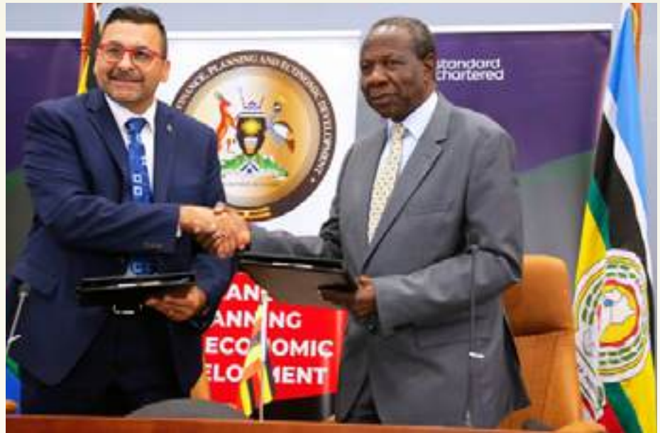
Hon. Matia Kasaija and Sanjay Rughani shake hands to mark the successful signing of the infrastructure financing agreements

The financing package will cover three major projects aligned with Uganda's Ten-Fold Growth Strategy, aimed at expanding the economy to USD 500 billion by 2040.