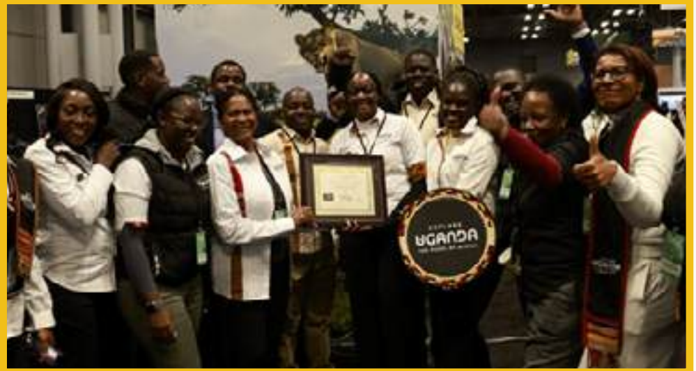
Ugandan delegates pose with the award certificate

N ew York, USA – Destination Uganda has been crowned “Best in Show – Africa” at the 2026 Travel & Adventure Show in New York, marking a major milestone in the country’s efforts to strengthen its tourism footprint in North America.