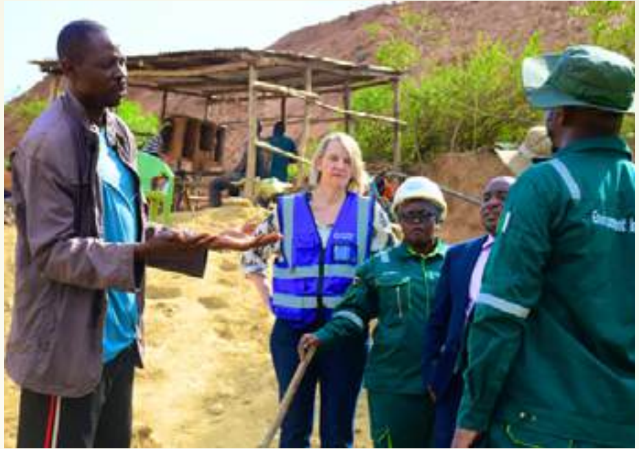
The joint government delegation touring processing facilities at Wagagai Gold Mine in Busia District ahead of training for Artisanal and Small-scale Mining Groups (ASMGs)

Limited, a subsidiary of China's Liaoning Hongda Enterprise Group, operates Uganda's first major large-scale gold mine and refinery in the Alupe area of Busia District. Commissioned by President Yoweri Museveni in August 2025, the $250 million project covers exploration, mining, and refining, producing gold of up to 99.99 percent purity.