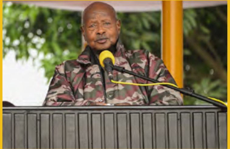
The President addresses the Officers

P resident Yoweri Kaguta Museveni who is also the commander-in-Chief of the Uganda People's Defence Forces (UPDF) has called on leaders to focus on identifying and solving people's practical needs, saying this has been the guiding philosophy of the National Resistance Movement (NRM) since the 1960s.