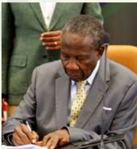
Hon. Matia Kasaija, Minister of Finance, Planning and Economic Development, signs the financing agreements on behalf of the Government of Uganda .....

million (UGX 754.5 billion) loan will fund Phase II of the Strategic Towns Water Supply and Sanitation Project. The project will benefit districts including Nakasongola, Kamuli, Mayuge, Bugweri, and Alebtong, providing water treatment plants and sanitation facilities for an estimated 740,000 people by 2030.