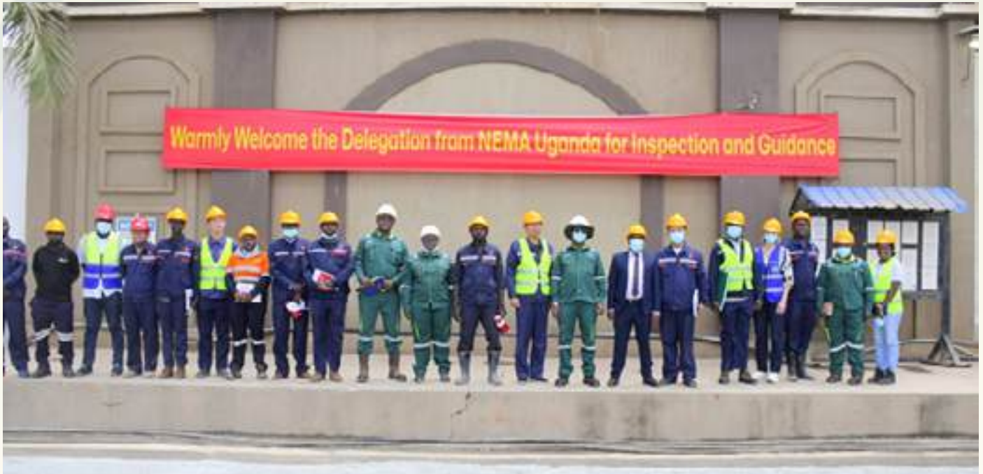
The delegation posing for a group photo at Wagagai Gold Mine