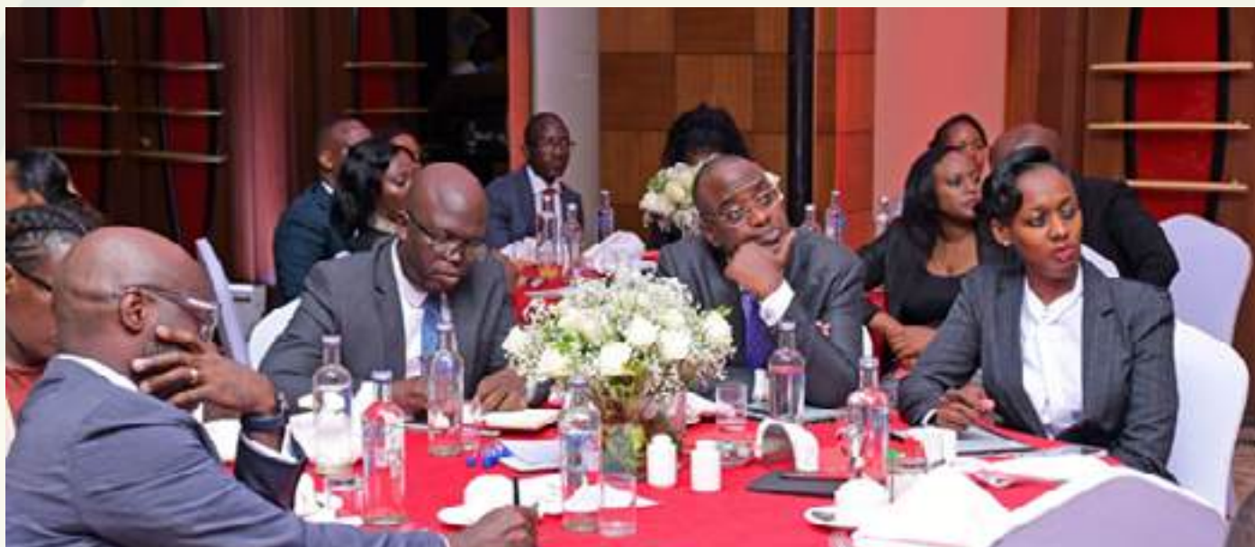
Leaders from government, finance, and industry convene to reflect on Africa's financial markets and future growth pathways

He attributed the strong performance to prudent macroeconomic management and sustained structural reforms, particularly in financial markets and regulatory frameworks. As a result, Uganda's nominal Gross Domestic Product is projected to expand to about USD 68.4 billion by June 2026, with income per capita expected to exceed USD 1,399.