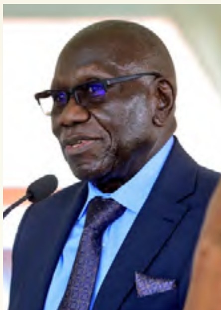
Prof. Celestino Obua - UNEB Chairperson addresses the press and the Guests during the release of PLE results at State House Nakesero

investments in secondary and vocational education, noting that 204 of 259 planned seed secondary schools have been completed under the UgIFT programme. Learners can also join community polytechnics through the newly established TVET system, providing an alternative pathway equivalent to O-Level education.