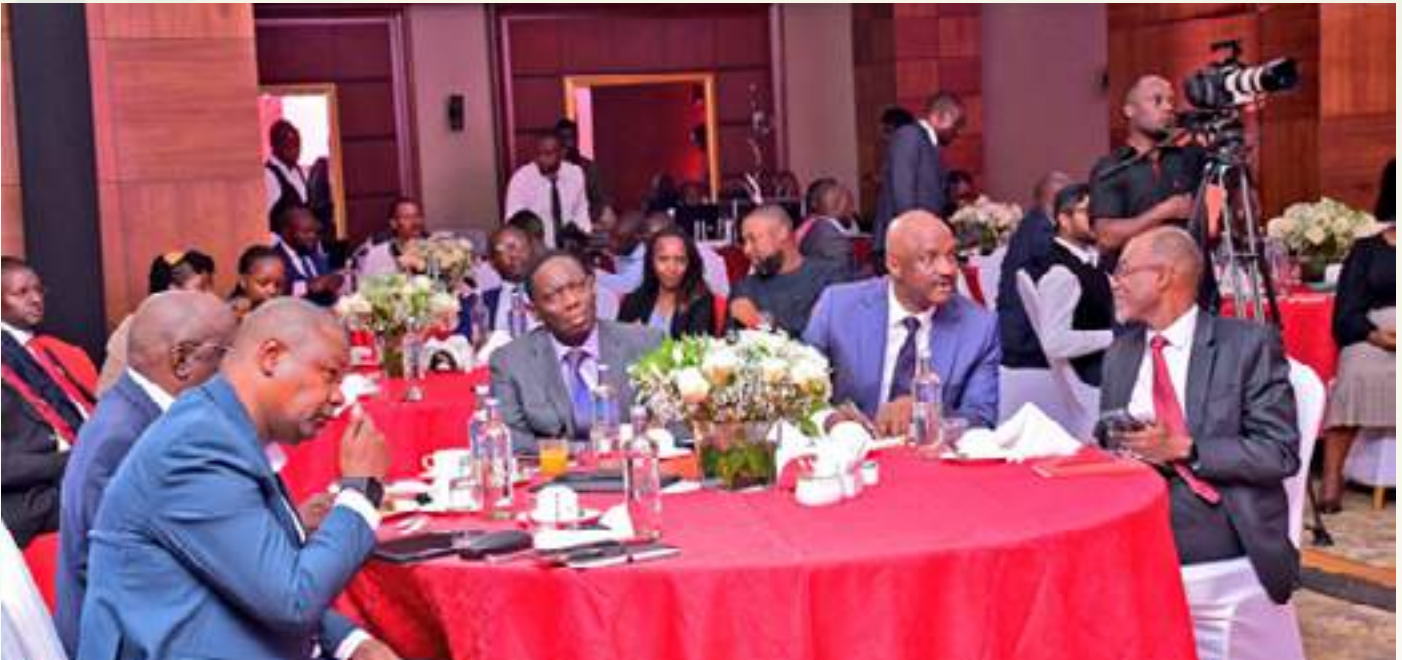
A wide view of the forum session as Uganda's projected economic growth and financial inclusion agenda are discussed

These include rebuilding capital markets to provide long-term debt and equity financing, attracting venture capital to support innovation with lower collateral requirements, and exploring the establishment of a small and medium enterprises-focused stock exchange for firms that do not yet qualify for main-board listings.